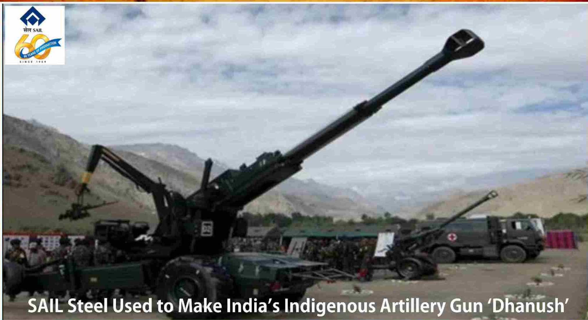
SAIL Steel Used to Make India's Indigenous Artillery Gun 'Dhanush'