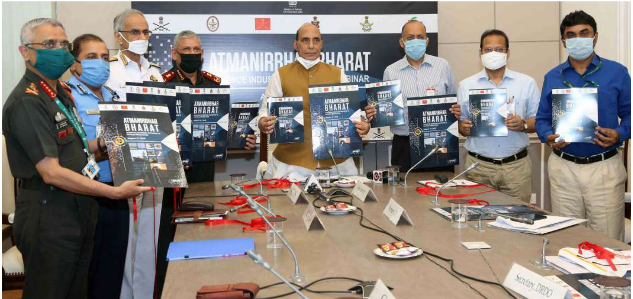
Shri Rajnath Singh releasing the publication on Atmanirbhar Bharat Defence Industry Outreach