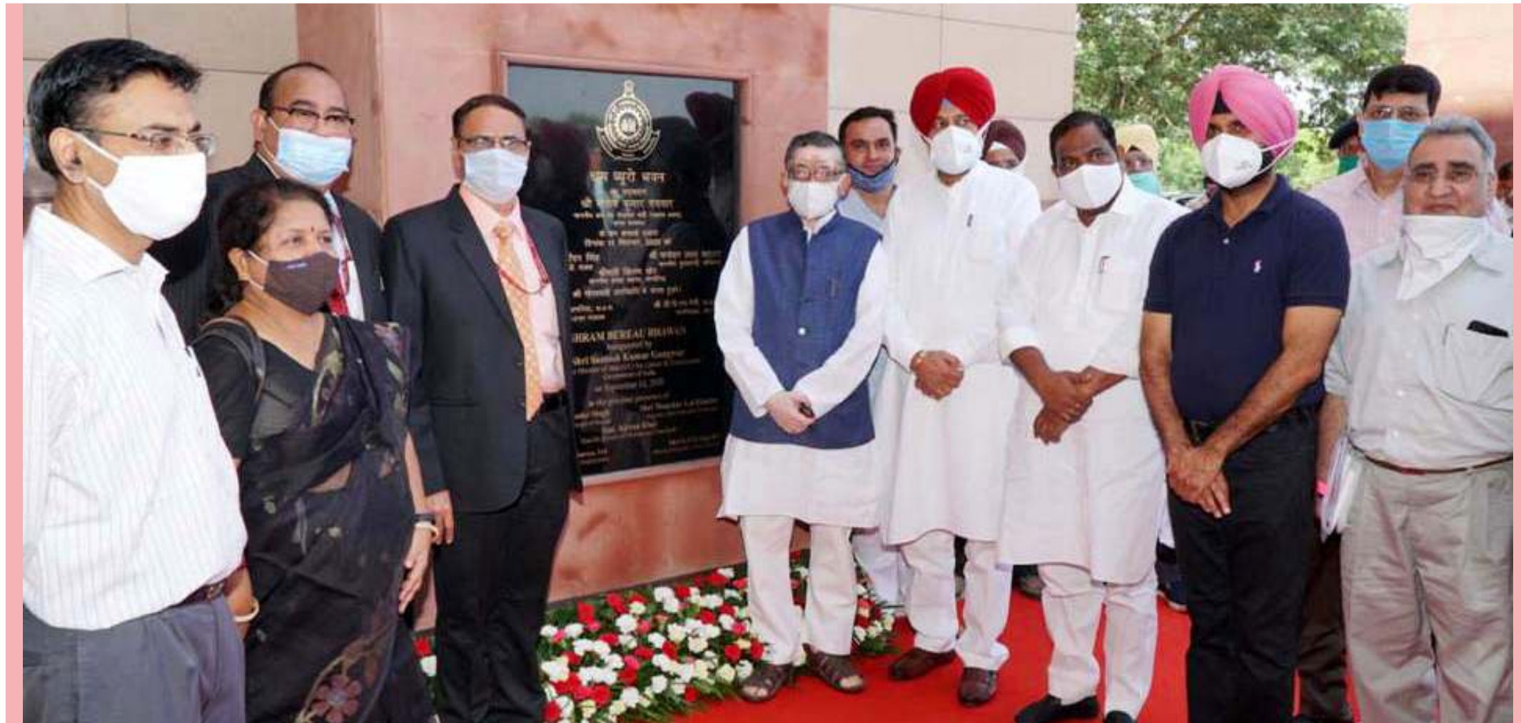
Shri Santosh Kumar Gangwar inaugurated of Shram Bureau Bhawan to mark the centenary year of Labour Bureau at Chandigarh